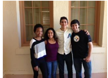
Merit Achievement and Hispanic Recognition

Click here for additional information regarding CHS's National Merit Commended Students, National Hispanic Recognition Program Scholars, and the National Merit Achievement Scholar. Congratulations to all of these CHS Scholars!