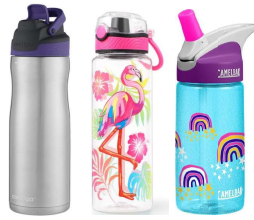
Water Bottle (consider a leak-proof one that can hold 20oz or more)

* Bonus points for backpacks with side pockets for water bottles