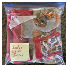
A change of clothing, uniform style with socks & underwear, in a Ziploc bag to be left in your kinder's backpack AT ALL TIMES

* SUPPLIES TO BE USED AT SCHOOL - LEAVE IN BOXES + LABEL WITH YOUR KINDER'S NAME! * (Please label boxes, not individual crayons, glue sticks, markers, etc.)