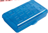
Plastic Pencil Box (5 x 8 in size)

ALL supplies will be for the individual child, they will not be shared.