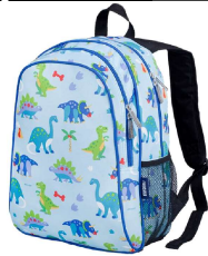
Backpack (big enough to fit a 9 x 12 folder & NO wheels or luggage)

* Bonus points for backpacks with side pockets for water bottles