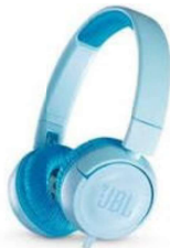
1 pair of headphones (We suggest the old school style, not earbuds)